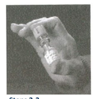
Steps 2-3 Mix the medication and shake the vial.