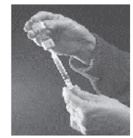
Steps 4-5 Insert the needle into the vial and draw up the medication.