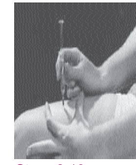
Steps 8-10 Hold the syringe like a dart, spread the skin pushing down slightly, and dart the needle into the thigh at a 90 degree angle.