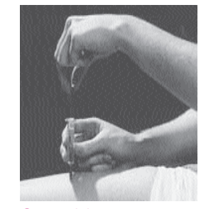
Step 11 Pull back the plunger to check for blood.